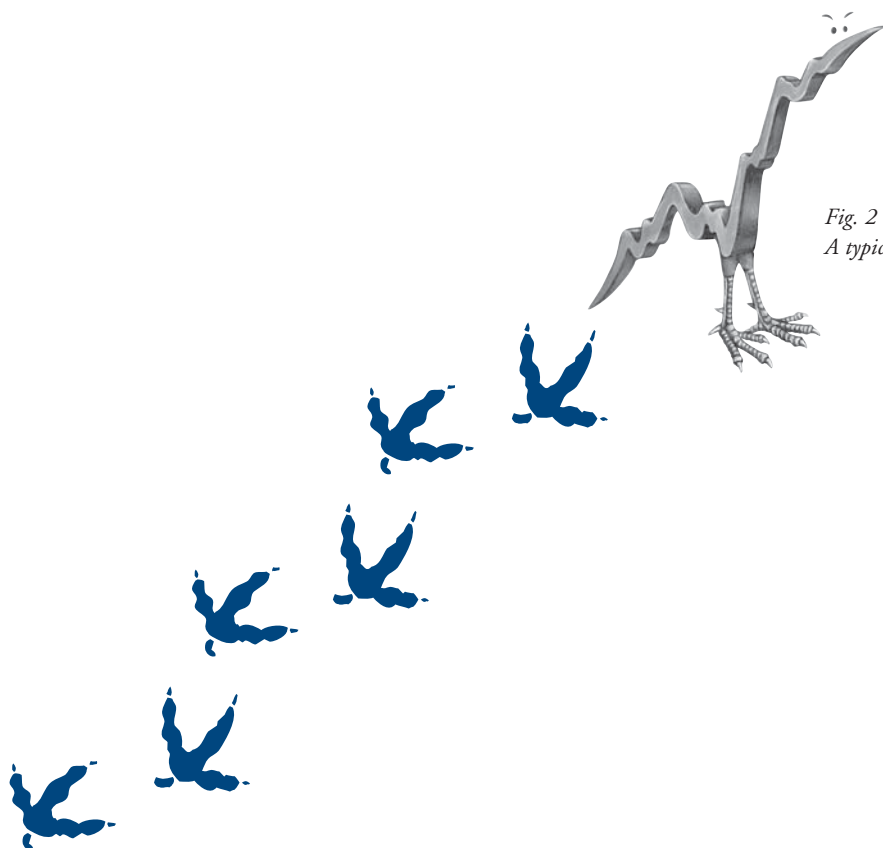
Fig. 2 A typical PROFIT